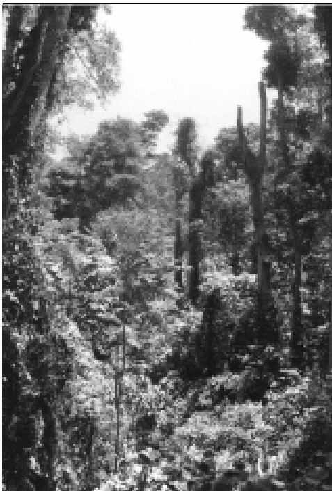
Figure 2. Forest gap created by the cutting of a large Newtonia buchananii by pit-sawyers in 1978. Left: view of the gap in 1987 looking towards the cut stump. Right: same view in 2006 showing the continuous canopy cover that now dominates the crown zone area of the treefall gap. In contrast the zone where timber extraction operations were carried out has remained pretty open with a low density of tree seedlings and saplings.

Mature plot: Until a large tree fell down recently (probably late 2005), little change occurred to the stand. The large hard logs that were on the ground (in black on Fig. 1) have partly decayed whereas the others (partly decayed in 1987) are now difficult to identify on the ground. Few trees appear to have grown much with the exception of most Maesopsis eminii (largest DBH increment was from 20 to 63 cm).