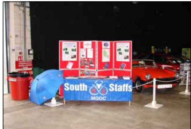
Club Stand at Stoneleigh

On our stand for the first time was my Midget.